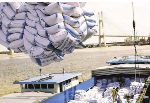
illustration image source (google images)