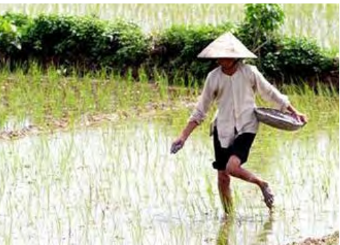
illustration image source (google images)