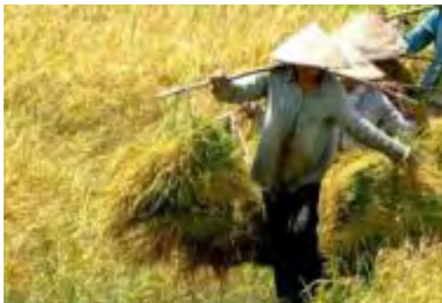
illustiontrative images source ( google images )