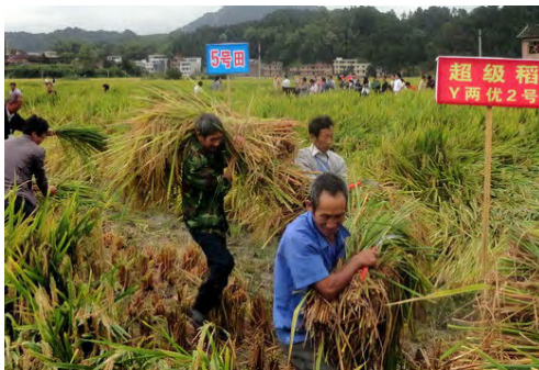
illustiontrative images