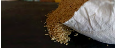
Milled rice at a processing factory in Vietnam's southern Mekong Delta. Indonesia, the world's fourth most populous country and a major buyers of Vietnamese rice, has not returned to Vietnam for new purchases this year.