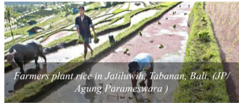
Farmers plant rice in Jatiluwih, Tabanan, Bali.