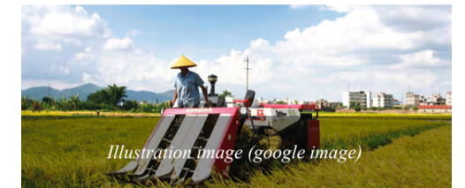
Illustration image (google image)

“Market demand is changing, and it's hard to make money by growing regular rice these days,” Wei said. Chinese farmers traditionally pursue quantity over quality when it comes to grain. But as incomes improve, consumers have become more demanding about quality. Meanwhile, prices of imported rice remain low, challenging China's cheap mid- and low-quality rice. [ Read more ]