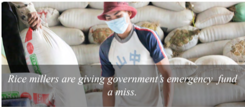
Rice millers are giving government's emergency fund a miss.