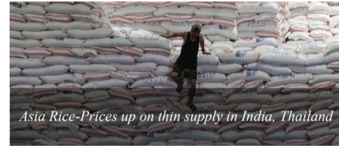
Asia Rice-Prices up on thin supply in India, Thailand