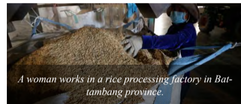
A woman works in a rice processing factory in Battambang province.