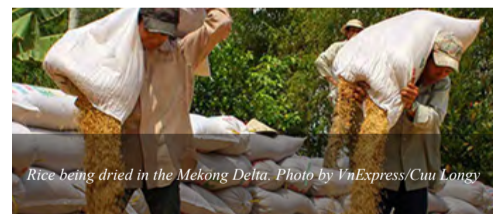
Rice being dried in the Mekong Delta.

A U.S. Department of Agriculture report late last month said preferential import taxes in Eastern European countries and Russia and an extended supply agreement with the Philippines may help boost Vietnam's rice exports this year by around 9 percent to 6 million tons. [ Read mtore ]