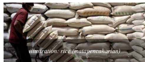
illustration: rice (matapencapaian)

“I want Bulog to stop selling 200,000 tons of commercial rice, as it creates deflation,” Amran said in Jakarta on Wednesday (5/3). [ Read more ]